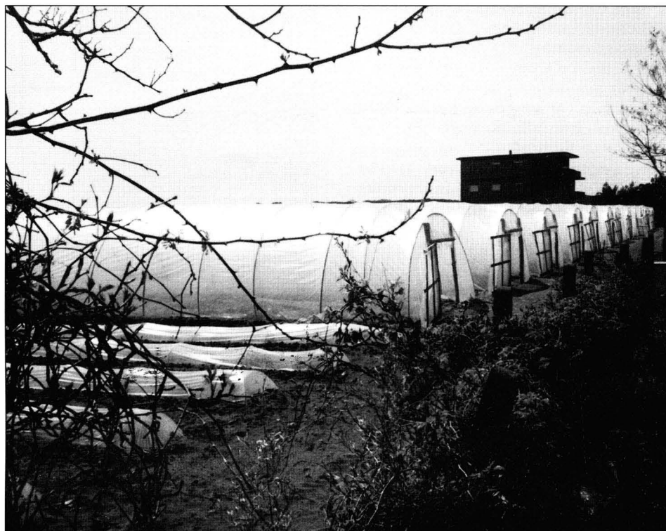
Figure 2 - Cold greenhouse tunnels with plastic film covering for vegetable production.

quality of products, to curb energy consumption and reduce labour time. Investment costs of such greenhouses can be 10 to 20 times higher than the above-said cold greenhouses for vegetable crops.