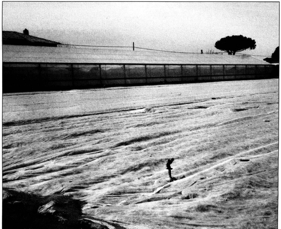
Figure 1 - Field with floating mulch and plastic greenhouse.

L'on propose ainsi des solutions de construction et d'équipements telle que la culture sans sol avec système clos dans la zone racinaire, afin de promouvoir un développement durable de la culture en serre à travers l'analyse des systèmes, visant à réduire la qualité et la quantité des contaminants et au recyclage des déchets.