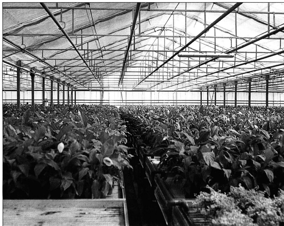
Figure 3 - Heated greenhouse with glass covering for pot plants production.