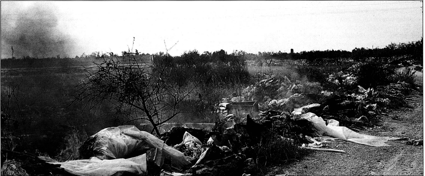
Figure 6 - Uncontrolled burning of greenhouse plastic film covering materials.

man, animals and plants and contributes to the atmospheric ozone destruction, its use will possibly be forbidden in few years time. Also the excessive use of fertilizers results in the supply of chemical compounds, especially nitrogen, phosphorus and heavy metal ions which can build up in water bodies, in the soils and in the plants with noxious effects on man;